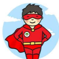
Keep it Up Captain