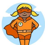
Have a Go Hero