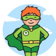
Team Effort Expert